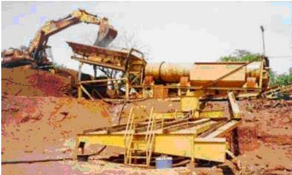
Figure 2.2. Photo of a typical wash processing plant for gold consisting of a grizzly, trommel, and sluice recovery system.

Dumping the ore on to a grizzly or screen removes oversize rock. The ore then passes through a revolving trommel with flowing water to wash the fines out and drop them down on to sluice boxes or shaker tables. The fines are then concentrated by panning, centrifuge, or other methods.